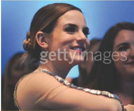
THE AMERICAN SINGER | SONGWRITER & ACTRESS JOJO DRESSES