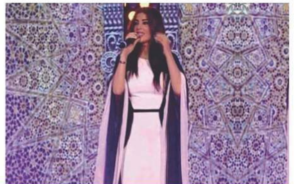
LEBANESE SINGER | DINA HAYEK