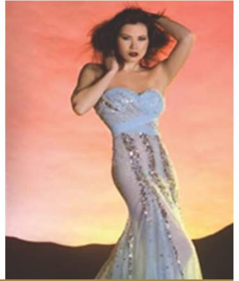
LEBANESE SINGER | NANCY AJRAM