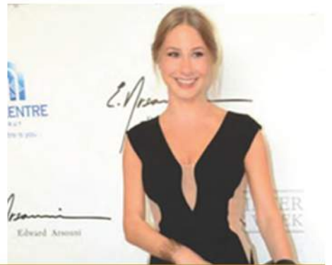
LEBANESE ACTRESS | DIAMAND ABOU ABOUD