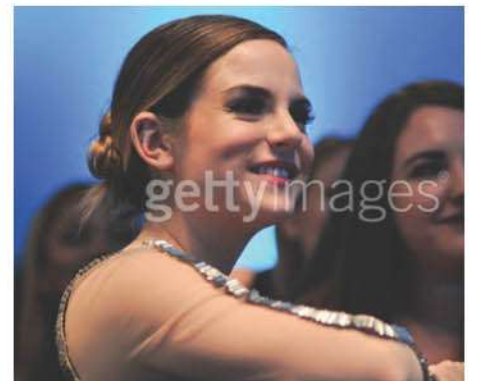
THE AMERICAN SINGER | SONGWRITER & ACTRESS JOJO DRESSES