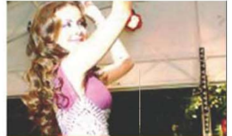
SINGER ROLA SAAD