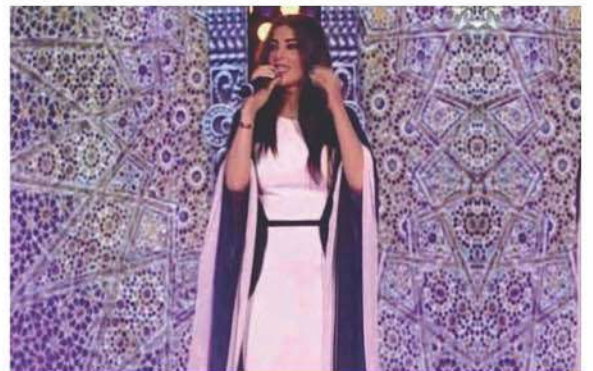
LEBANESE SINGER | DINA HAYEK