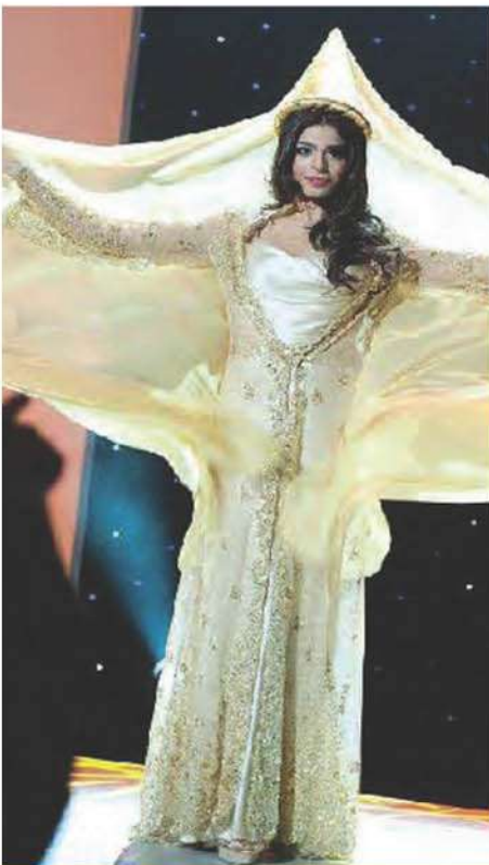
MISS LEBANON 2010