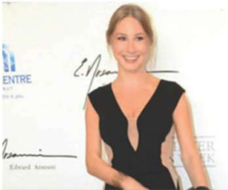
LEBANESE ACTRESS | DIAMAND ABOU ABOUD