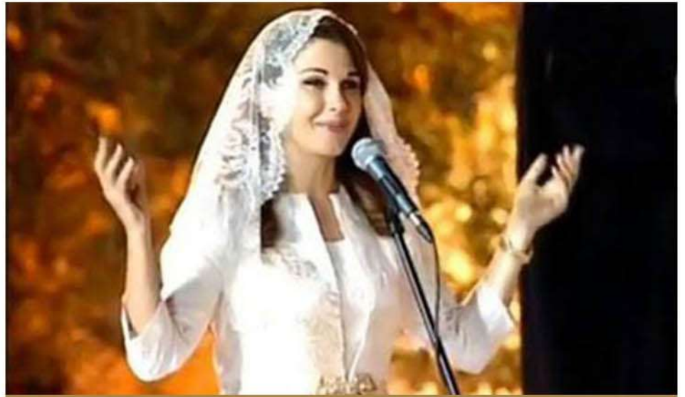
MAJIDA AL ROUMI